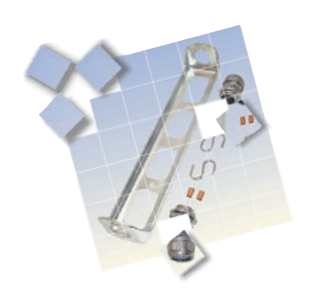
Link Housing Kits — We put it all together for You!